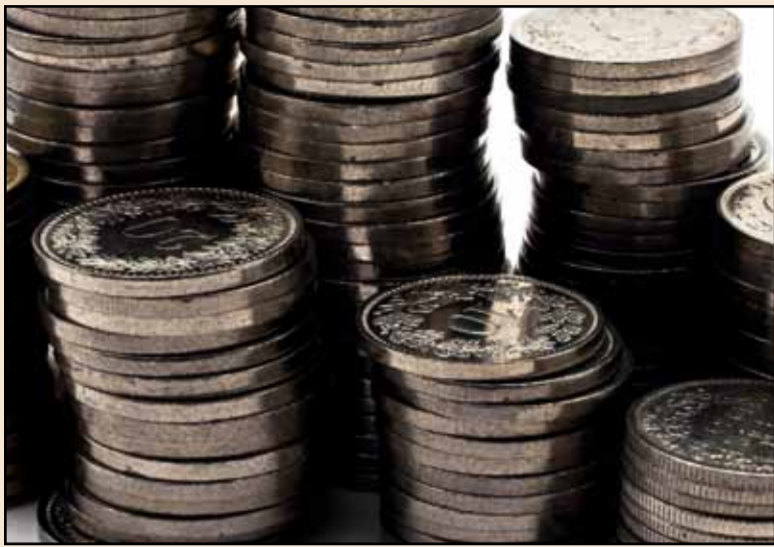
Have you looked at your retirement savings to ensure you have what you need?

an emotional attachment (that inevitably you and your friends or family would have).